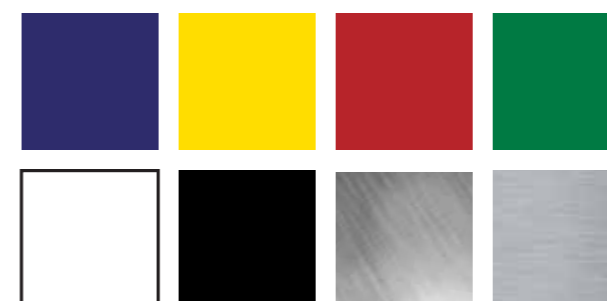
TABLE OF COLOURS FOR etalbond® light & slim

etalbond® slim due to it's favourable ratio of material capabilities versus price substitutes materials like foam pvc, solid polyester panels and is a worldwide success.